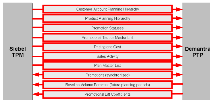
Figure 2.Integration Points

The integration allows users to plan promotions in Siebel with the advantage of a Demantra generated baseline volume forecast and Demantra generated lift coefficients for calculation of incremental promotional volume. Users can also take advantage of the advanced planning capabilities in Demantra to perform