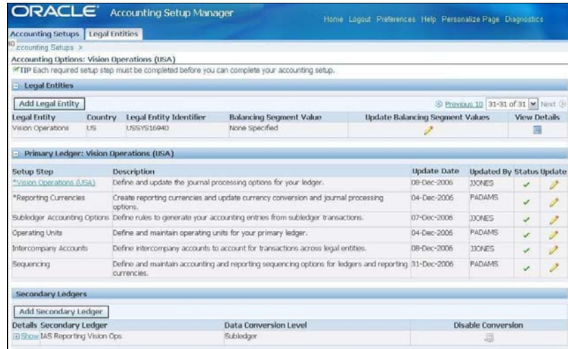
Figure 1. Accounting Setup Manager