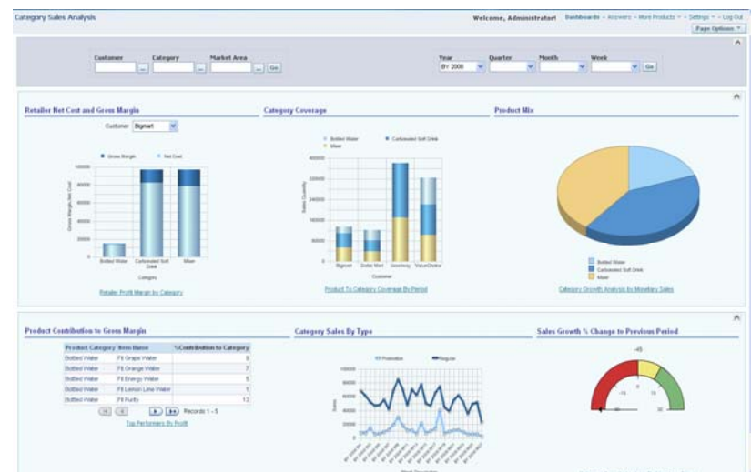
Figure 1: Oracle Demand Signal Repository – Category Management Dashboard

Consumer goods and high technology companies that sell consumer products have historically based their demand knowledge on little more than their own shipment records, augmented with aggregate syndicated data. However, today many leading retailers share store-level point of sale (POS) and inventory data directly with their suppliers. Due to the rapid expansion of the number and formats of retailer data sources, it has become more expensive to implement them as one off projects. In addition, line-of-business executives are unable to access concise and accurate demand insights across customers.