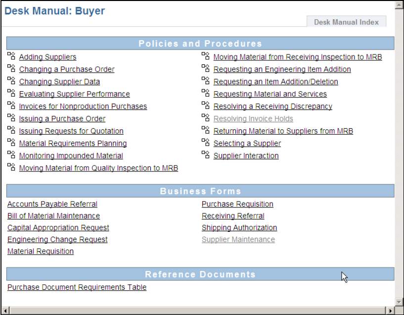
Figure 2. HTML version of the Desk Manual for Buyer