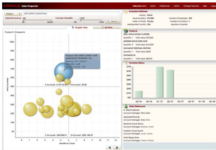
Figure 2. Oracle's Social CRM On Demand applications maximize the effectiveness of critical sales activities such as sales prospecting.

Furthermore, they can deploy Oracle’s Social CRM On Demand applications to improve sales rep productivity and collaboration. These applications are optimized for prospecting, personal sales campaigning, and presentation development. These are all critical activities in any environment, and particularly so in the midst of a transformation when the risk of losing focus on core competencies increases.