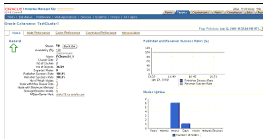
Figure 1. Oracle Enterprise Manager eases the administration of Oracle Coherence clusters.

Monitoring the Oracle Coherence cluster with Oracle Enterprise Manager is significantly faster than other monitoring tools because bulk management beans are used for metric collection and other critical tasks such as configuration management.