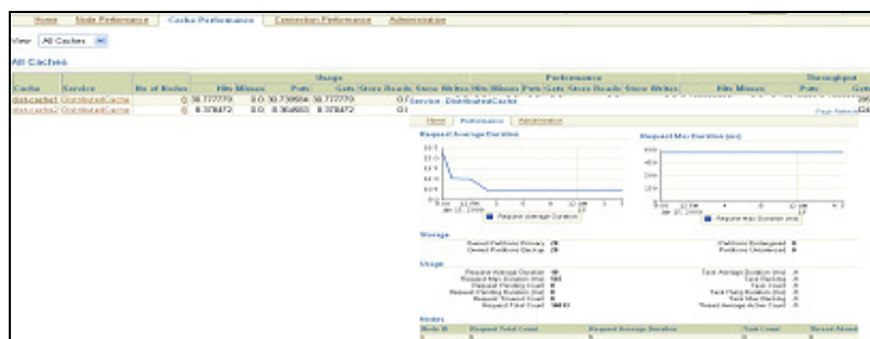
Figure 3. View charts for all caches and services within a cluster and drill down to details.

Oracle Enterprise Manager provides you with a rich set of charts and metrics on usage, performance, and throughput for all caches and services defined in a cluster. Using these charts and metrics you can diagnose problems related to a specific application or module. For example, a high number of cache misses indicates the plausible performance bottleneck in an application. Similarly, you can troubleshoot database issues by looking at store reads and store writes of a cache. In the case of services, if an application is using a distributed cache, then monitoring the distributed cache service will provide important metrics related to partitions and request average duration. All of the charts can be navigated by mouse click and support drill down views; for services, the detail pages include availability and correlation with nodes.