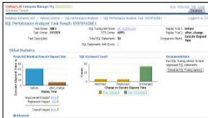
Figure 2: SQL Performance Analyzer Report

weighting the workload in assessing the net impact. Additionally, improvements, regressions, and SQL with unchanged performance are listed in the report. If there are any regressed SQL statements after the system change, recommendations on how to correct the regressions are also provided with the SQL Tuning Advisor and SQL Plan Baselines features of Oracle Database 11g. Further, the execution plans generated on the test system with system change implemented can be used to seed the SQL Plan Baseline repository on a production system to make sure only the previously validated execution plans are picked by the optimizer. Any new plans generated by the optimizer after seeding through the SQL Plan Baseline feature can be validated automatically by the database by test-executing them or manually by the DBAs.