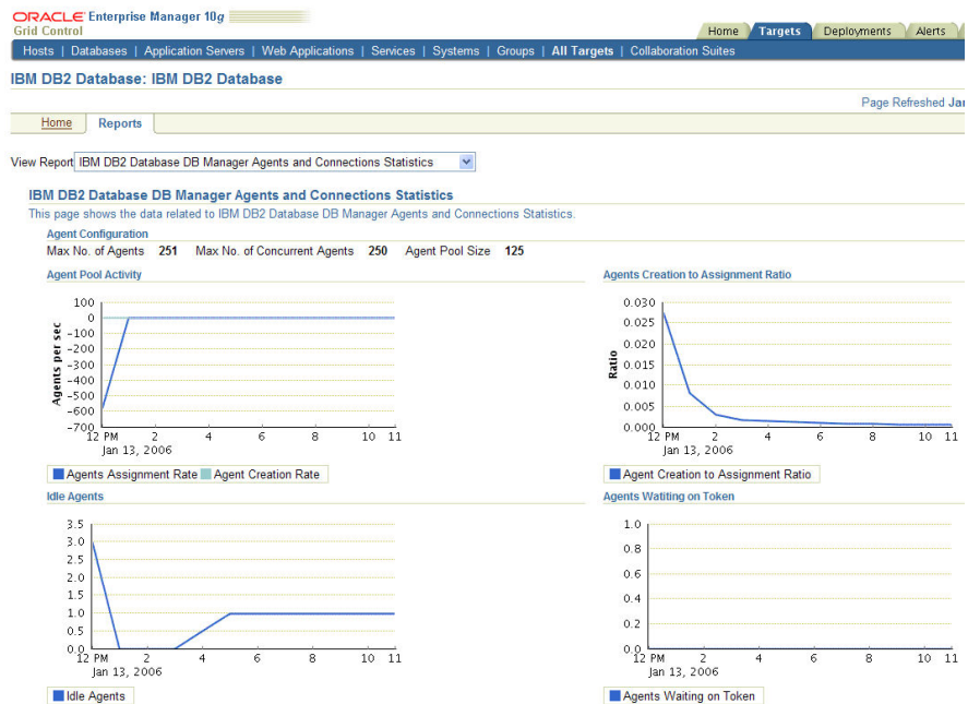
Figure 1. IBM DB2 DB Manager Agents and Connections Report.

seventeen out-of-box reports, summarizing key information about IBM DB2 availability, performance, resource consumption and configuration. These reports are easily accessible from the IBM DB2 Home page in the Grid Control Console and from the Information Publisher (Enterprise Manager's powerful reporting framework), enabling administrators to schedule, share, and customize reports to fit their operations needs.