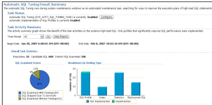
Figure 2: Automatic SQL Tuning Report.

The Automatic SQL Tuning Advisor can be configured to run in any maintenance window or can be disabled altogether if desired.