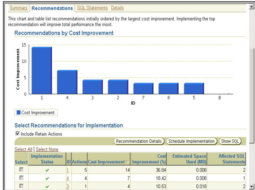
Figure 4: SQL Access Advisor Recommendations page.

Figure 4 shows the SQL Access Advisor recommendations page. The recommendations are ordered by the workload improvement factor. User can select one or all of the recommendations and implement them by simply clicking the Implement button.