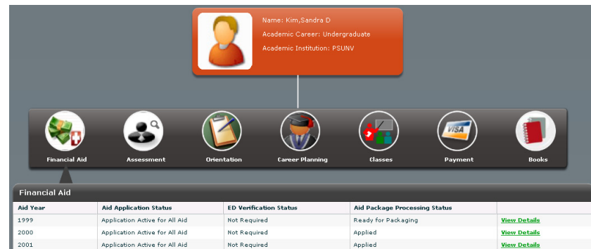
Figure 2. This student enrollment process shows related financial aid, classes, payments, and books.