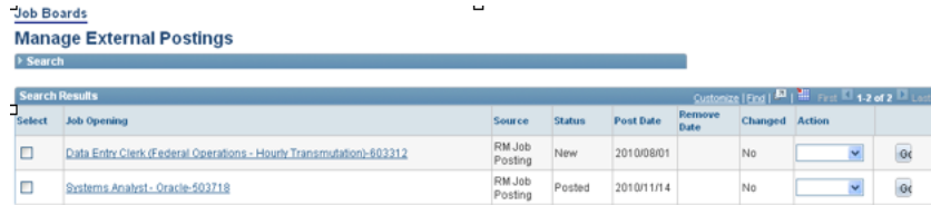
Figure 2: Manage postings.

Recruiters then manage job postings through the delivered Manage External Postings screens.