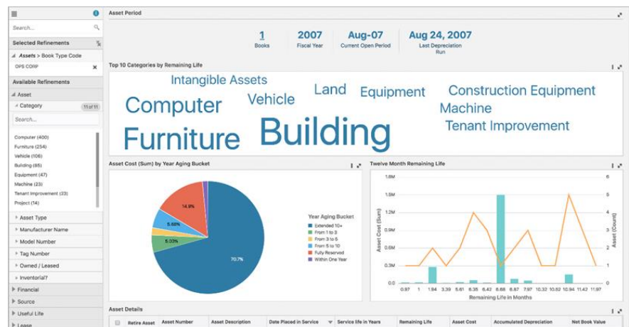
Figure 2: Asset Aging Dashboard in Oracle Assets Command Center

The Oracle Assets Command Center is available at no additional cost to licensed users of Oracle Financials, Release 12.2.4 and above.