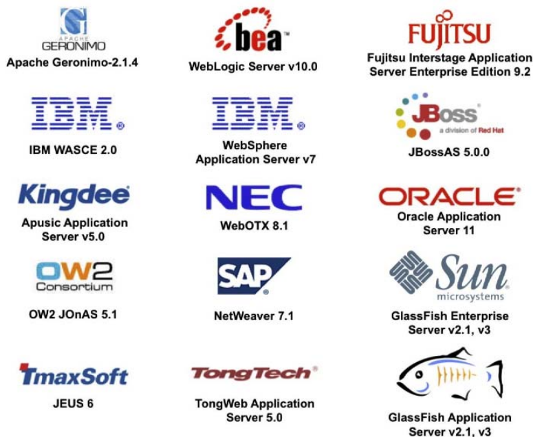
Figure 2. This image shows a list of application servers that are compatible with Java EE 5. Oracle GlassFish Server 3 is compatible with Java EE 6, and many of the leading vendors are expected to be compatible with this latest specification.

Java EE compatibility ensures that applications written for previous versions can run unchanged on subsequent versions. Oracle GlassFish Server 3 is backward compatible—Java EE 5–based applications and Oracle GlassFish Server 2 applications can run unchanged on Oracle GlassFish Server 3.