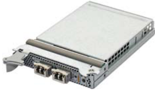
Figure 2. The Sun Dual 10 GbE XFP PCIe ExpressModule for blade servers without a transceiver (Sun X1028A-z)

The networking cards also make it easier to optimize and customize resources for applications, services, and users. Their load balancing and granular resource control features enable incoming packets to be assigned to specific CPU threads or balanced across L1, L2, L3, and L4. This offers a high level of flexibility and granularity for assigning resources and can help avoid I/O bottlenecks.