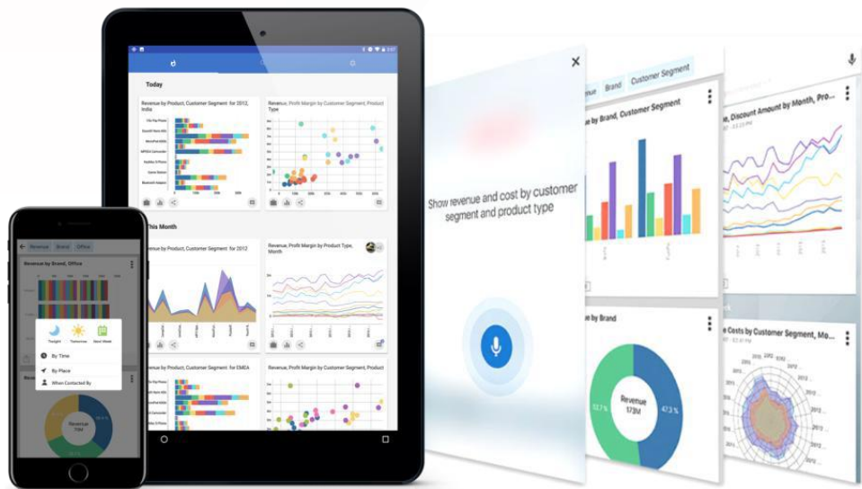
Figure 4. Contextual, voice-driven analytics in Oracle Day by Day.