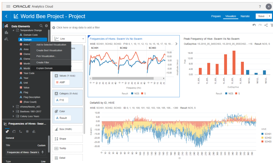
Figure 3. Sample visual data flow in Oracle Data Visualization Desktop (included with Oracle Analytics Cloud)