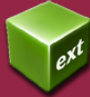
Oracle VM VirtualBox Extension Pack

Consists of all open source components and is licensed under the GNU General Public License (GPL) Version 2