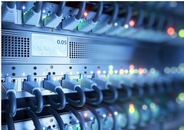
iSCSI and NFS Storage

The value of this solution is that there is a minimal learning curve. It's a customer's VMware implementation on top of Oracle's hardware -- gated, secured, managed, and controlled by your existing VMware staff, yet housed on OCI's hardware. The flattened learning curve means the customer can be up and running as soon as the data pipe is in place. Wizards exist to build the SDDC implementation, the Horizon View architecture, and many other components of the required VMware solution, practically out of the box.