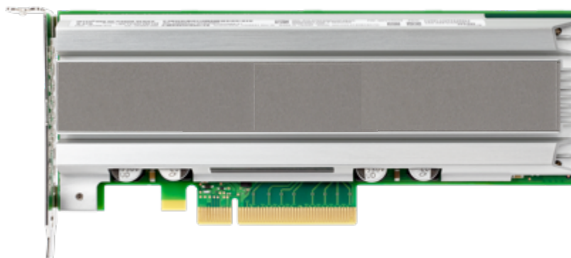
Fig 2: Flash Accelerator PCIe Card

"We chose Oracle Exadata because it offered a complete solution ... we've created daily financial reports 4x faster and liquidity risk reports 7x faster to consistently meet our service-level agreement, improved credit risk management, and reduced our data center footprint."