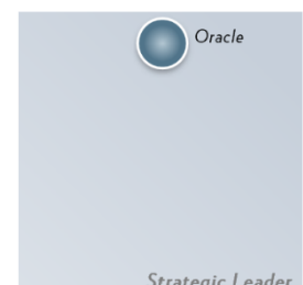
Oracle position within the 9-Grid™ Zone

For more information see the Fosway 9-Grid™ Trajectory Guide on our website.