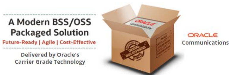
Image 1. DBX is a BSS/OSS packaged solution delivered on Oracle technology by Oracle

Oracle Digital BSS Express (DBX) is a modern, pre-integrated, and extensible BSS/OSS solution delivered on Oracle's carrier-grade technology by Oracle Customers Solutions for Industries – Communications (CSI-Communications). The prebuilt order-to-cash solution implements industry best practice business processes.