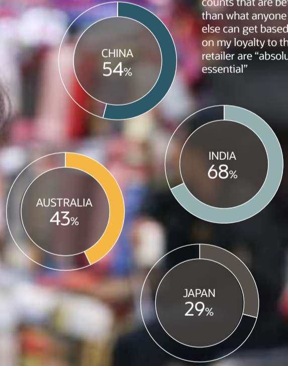
% stating offers / discounts that are better than what anyone else can get based on my loyalty to that retailer are “absolutely essential”

Forging deeper connections with customers is a rich vein to mine albeit one with infinite seams. 43 percent of JAPAC consumers stated that “offers / discounts that are better than what anyone else can get based on my loyalty to that retailer are ‘absolutely essential’” . This is slightly less demanding than the global average of 48 percent but with significant differences across the region.