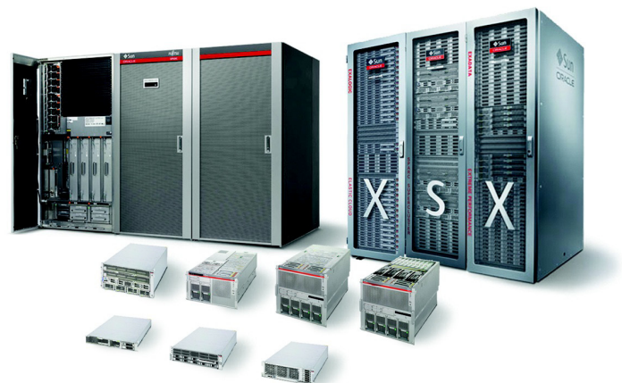
Figure 1. Oracle's server portfolio provides a broad selection to suit virtually any IT requirement. For the ultimate in extreme scalability, Oracle offers pre-integrated, engineered systems, shown on the right.

Useful for SAP administrators when performing system maintenance, hardware upgrades, software patching, and system consolidation, live migration enables developers and QA engineers to clone the