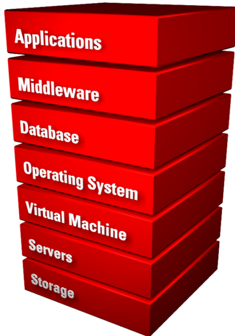
Figure 1. Oracle's hardware and software stack is optimized for creating and running comprehensive enterprise solutions

Many IT organizations spend considerable time and budget trying to figure out whether or not applications work well together on a particular platform, with the necessary infrastructure, and at the appropriate patch level. Once this has been determined, they must then spend the time to integrate all these components into a production system. There is another way—Oracle's integrated product stack approach. (See Figure 1.)