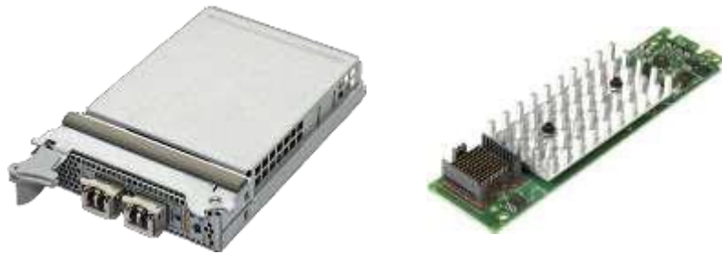
Sun Dual Port 10 GbE PCIe 2.0 EM Sun Dual Port 10 GbE PCIe 2.0 FEM