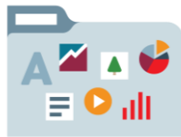
Manage data and tools