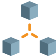
Work in standardized environments