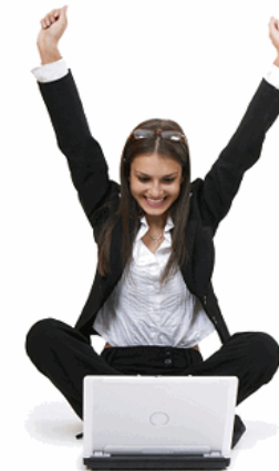
Make end users happy and productive