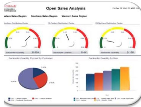
Real-time, tactical problem solving