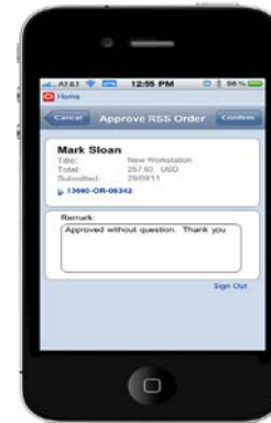
Get notified, take action