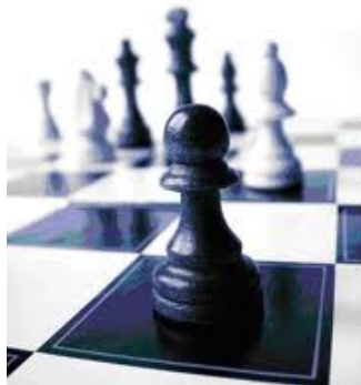
Plan and develop strategies