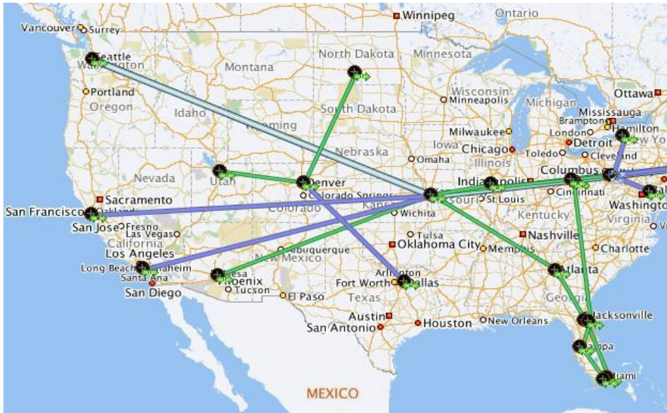
Figure 2: Optimize all modes and across all geographies, determining the right course of action for all orders and shipments based on cost, service level and asset availability.