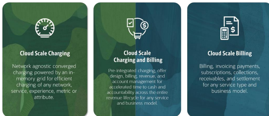
Image 3. Oracle's Cloud Scale Charging and Billing is a unified solution with unique benefits.

Full revenue lifecycle management. Rapidly explore new business models with accurate revenue accountability from network authorization through to charging and billing across B2C, B2B and B2B2X offerings.