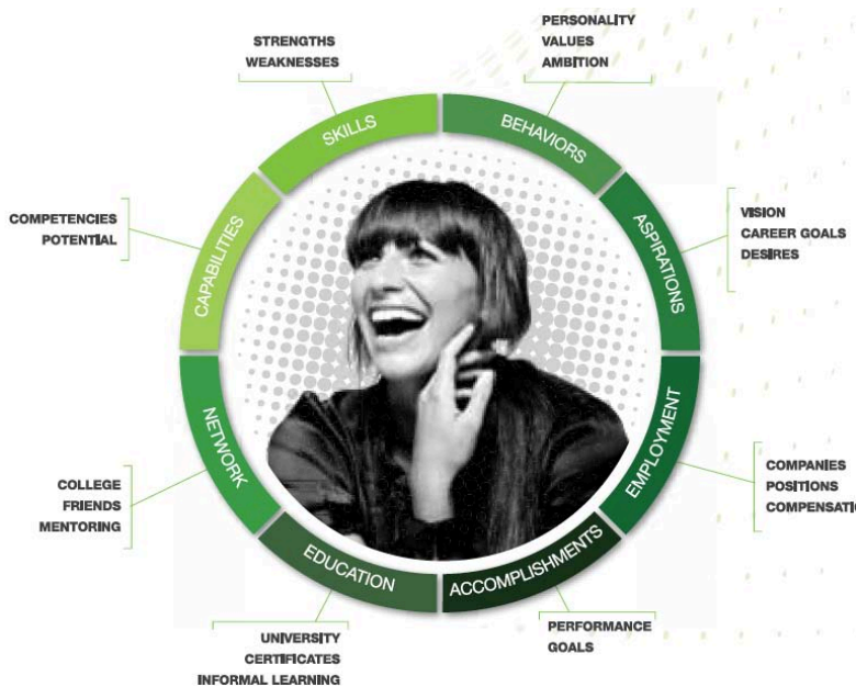
Figure 1. Capture and use information about skills, experience, performance, and career objectives to put people into roles in which they will succeed.