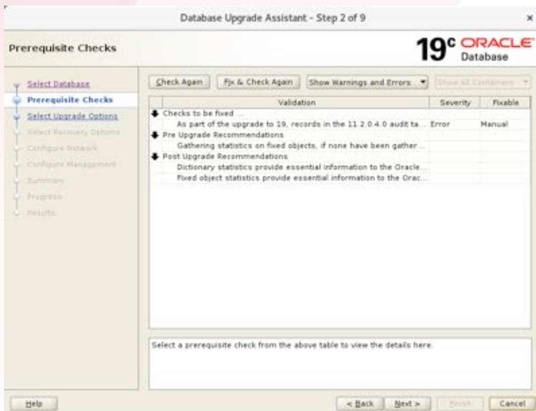
Figure 1. Screenshot of DBUA Prerequisite Checks Page

In this screenshot, the steps in the workflow are listed in the left-hand pane of the window, while the prerequisite checks run by DBUA are in the right-hand pane.