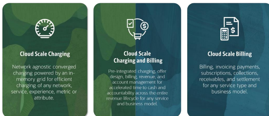
Image 3. Oracle's Cloud Scale Charging and Billing is a unified solution with unique benefits.

Full revenue lifecycle management. Rapidly explore new business models with accurate revenue accountability from network authorization through to charging and billing across B2C, B2B and B2B2X offerings.