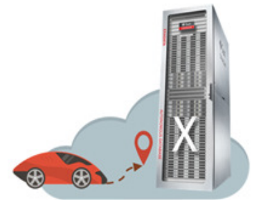
Autonomous Database on Dedicated Exadata Cloud Infrastructure

Oracle Autonomous Database uniquely combines automation, machine learning, and cloud agility to deliver the world's first autonomous cloud database management system. Available in Public Cloud or On-Premises, Autonomous Database on dedicated Exadata infrastructure enables IT to achieve the highest degree of security and governance while providing an entirely self-service Autonomous Database experience for its consumers.