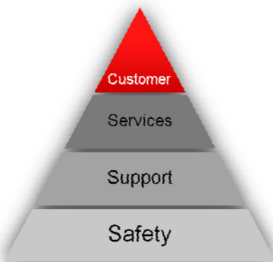
Fig. 1 Conceptual foundation for telematics

Next is support. This includes innovative new insurance models such as "Pay-Per-Use" or "Pay-As-You-Drive." These new models will offer the ability to adjust premiums based on driver behavior at a much more granular level than was previously possible. The option of using these models should attract reliable low-risk drivers looking for insurance that rewards their good habits. In addition, there are a number of other ways a telematics system could support the driver.