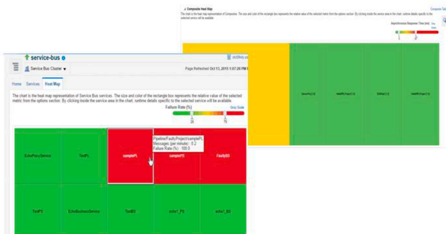
Figure 1. Service Bus and SOA Composites Heat Map

Oracle Enterprise Manager allows you to manage your Oracle SOA Suite applications leveraging a model-driven “top-down” approach within your development, quality assurance (QA), staging, and production environments. Business application owners and operational staff can automatically discover and correlate your SOA composites, components, services, and back-end Java EE implementations through detailed modeling and drill-down directly into the performance metrics at the component level. Business transactions and service dependencies can be automatically