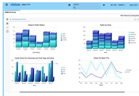
Figure 2 Warehouse Management Business Intelligence