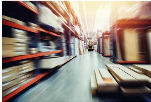
Figure 3 Warehouse Management

Route & Shipment Management – Organize your outbound staging and loading by creating shipping routes to manage the progress of loads and determine shipment accuracy.