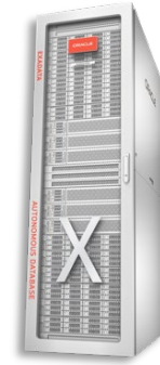
Oracle Exadata Database Machine X10M

The Oracle Exadata Database Machine (Exadata) is engineered to deliver dramatically better performance, cost-effectiveness, and availability for Oracle databases. Exadata features a modern cloud-enabled architecture with scale-out high-performance database servers, scale-out intelligent storage servers with state-of-the-art PCIe flash, unique storage caching using RDMA accessible memory, and cloud-scale RDMA over Converged Ethernet (RoCE) internal fabric that connects all servers and storage. Unique algorithms and protocols in Exadata implement database intelligence in storage, compute, and networking to deliver higher performance and capacity at lower costs than other database platforms. Exadata is ideal for all types of modern database workloads, including Online Transaction Processing (OLTP), Data Warehousing (DW), In-Memory Analytics, Internet of Things (IoT), financial services, gaming, and compliance data management, as well as efficient consolidation of mixed database workloads.