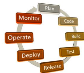
Enable an Agile DevOps Cycle with Oracle Cloud.

“Oracle Management Cloud has given us a competitive advantage as our developers have greater speed, efficiency, and control over the new releases to customers.”