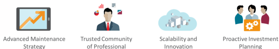
Figure 3. Become part of the Trusted Community