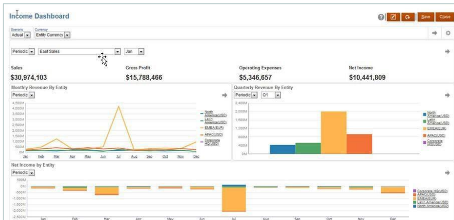
Configurable dashboards make it easy to quickly visualize data in real-time

Financial Consolidation and Close can be configured to fit individual organizations' requirements. Using best practices, coupled with pre-seeded content the system allows organizations to build an application that meets their business needs without having extraneous functionality that are not required. It enables organizations to combine a world class consolidation solution with the ability to tailor the solution for the features they require.