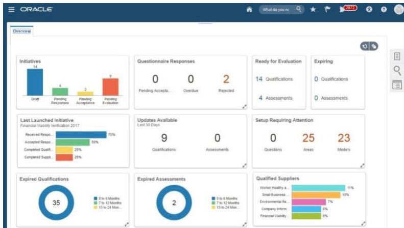
Figure 1: You can take action based on key statistics and current supplier qualification activity, focusing your time on the most urgent items.

Oracle Supplier Qualification Management Cloud, an integral part of Oracle Procurement Cloud solutions, provides a complete solution for managing your suppliers' qualifications and capabilities, including monitoring compliance with your business policies and storing supporting documentation.