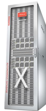
Oracle Exadata Database Machine X9M-8

Exadata is the most thoroughly tested and tuned platform for running Oracle Database.