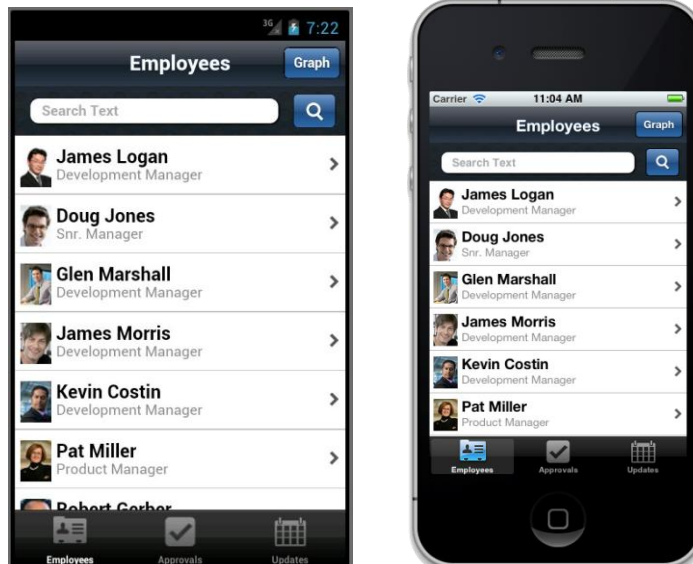
Figure 1: Same application running on Android and iOS

Based on a hybrid architecture, Oracle ADF Mobile lets you build application that are portable across devices and operating systems while still leveraging the device specific capabilities and delivering excellent user experience. Applications developed with Oracle ADF Mobile can be designed for phone and/or tablet form factors and can be packaged for either Apple iOS or Google Android – from a single code base. Oracle ADF Mobile leverages the power of the Java and HTML5 technologies along with visual and declarative development approach to provide a faster way to build on-device mobile applications. Oracle ADF Mobile applications install on-device, can work in both connected and disconnected mode and can access device services as well a local SQLite database.