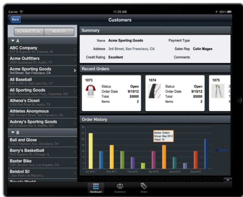
Figure 3. Visually attractive mobile user interfaces

An Oracle ADF Mobile application can be developed such that it can work well on either a tablet or a phone. When the application starts the appropriate form factor will load. Tablet views are often fewer in number, but more complex, including patterns such as list-details and so on. Whereas phone views are often greater in number but generally simpler due to screen size constraints. Defining both sets of views within the same application promotes reuse for business logic, data access, web service integration and so on.