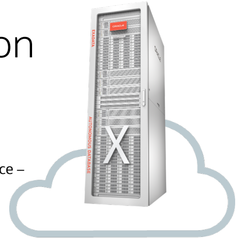
Oracle Exadata Cloud@Customer X11M

Run Oracle's most powerful, available, and flexible cloud database service – Oracle Exadata Database Service – in your data center on Exadata Cloud@Customer