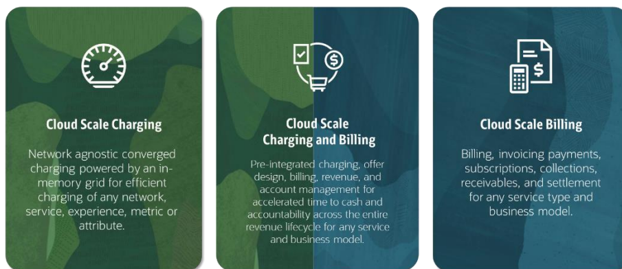
Image 3. Oracle's Cloud Scale Charging and Billing is a unified solution with unique benefits.

Full revenue lifecycle management. Rapidly explore new business models with accurate revenue accountability from network authorization through to charging and billing across B2C, B2B and B2B2X offerings.