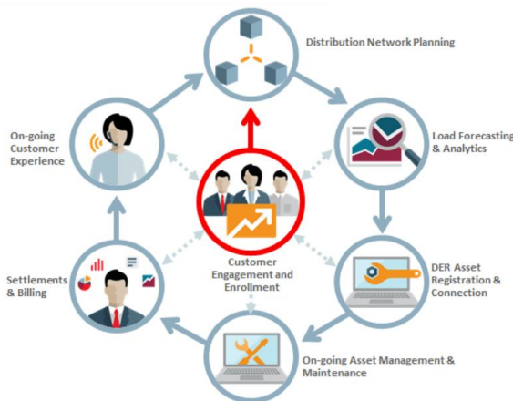
Figure 2. The DER Lifecycle Map-begins and centers around the customer

To meet the challenges of a more distributed model, utilities have to rapidly develop new processes to manage DER assets and maintain them over time. It is important to note that the DER lifecycle management process starts with the customer and ensures that they remain engaged throughout the entire lifecycle.