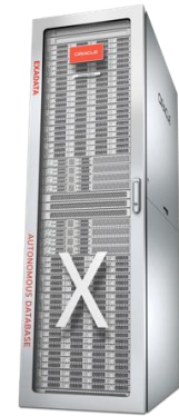
Oracle Exadata Database Machine X9M-2

The Exadata Database Machine is the most cost-efficient and highest performance platform for running Oracle Databases. Exadata is easy to deploy even for the most mission-critical systems, as the database servers, storage servers and network are pre-configured, pre-tuned and pre-tested by Oracle experts. Extensive end-to-end testing and validation ensures all components including database software, operating system, hypervisor, drivers, firmware, work seamlessly together and that there are no performance bottlenecks or single points of failure.