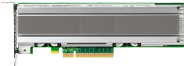
Figure 3. Flash Accelerator PCIe Card

These are real-world end-to-end performance figures measured running SQL workloads with standard 8K database I/O sizes inside a single rack Exadata system. Exadata's performance on real Oracle Database workloads is orders of magnitude faster than traditional storage array architectures, and is also much faster than current all-flash storage arrays, whose architecture bottlenecks flash throughput.