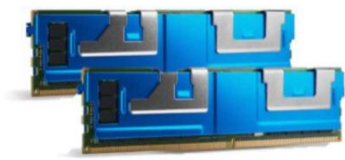
Figure 2. Intel® Optane™ Persistent Memory modules

databases using database access controls, ensuring end to end security of data. Deploying persistent memory in Exadata X9M is so simple, it's transparent.