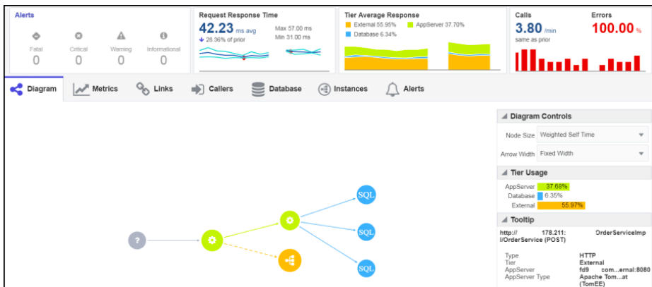
Figure 2. Deep application visibility across all application components.

To deliver high-quality applications requires deep visibility into the performance of the applications at all levels. Today, applications execute across a distributed environment in a web browser, across application servers, and in databases. With Oracle Application Performance Monitoring Cloud Service, you know the performance of your application at all levels. From the actual browser and Ajax performance for all users, through the server side request performance as the transactions pass through multiple application servers, and finally down to the granular application code level where you can see the actual performance for method and SQL level operations. By leveraging automated discovery and advanced reporting you can incrementally and systemically improve the performance of your applications as they change.