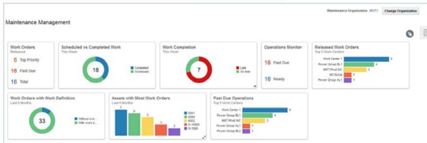
Figure 3. Maintenance Management landing page

Work orders are socially enabled so you can collaborate on problems using Oracle Social Network, and Oracle Transactional Business Intelligence gives you quick and easy reporting capabilities. All designed for use on a tablet and/or smartphone, so you can take action on the go.