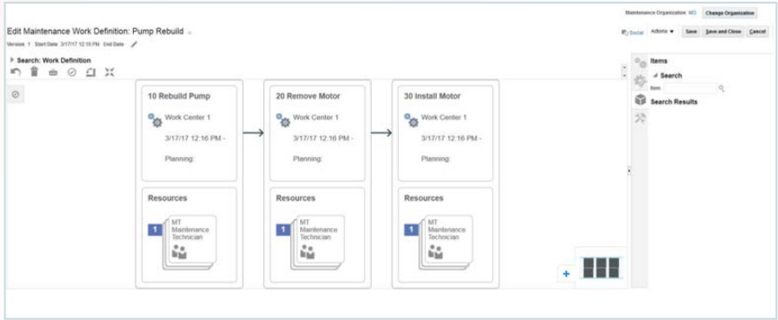
Figure 1. Work Definition - Visually design a work definition

Visually define your maintenance processes using Work Definition. Define the maintenance operation steps, and then drag and drop resources and materials to the process to easily complete the flow. Leverage Oracle Social Network to collaborate with colleagues and stay connected regarding updates to work definitions.