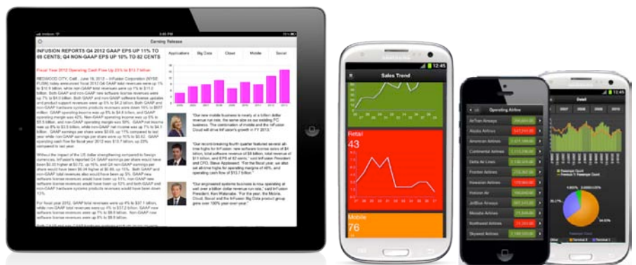
Figure 1 – BI Mobile App Designer apps on mobile devices