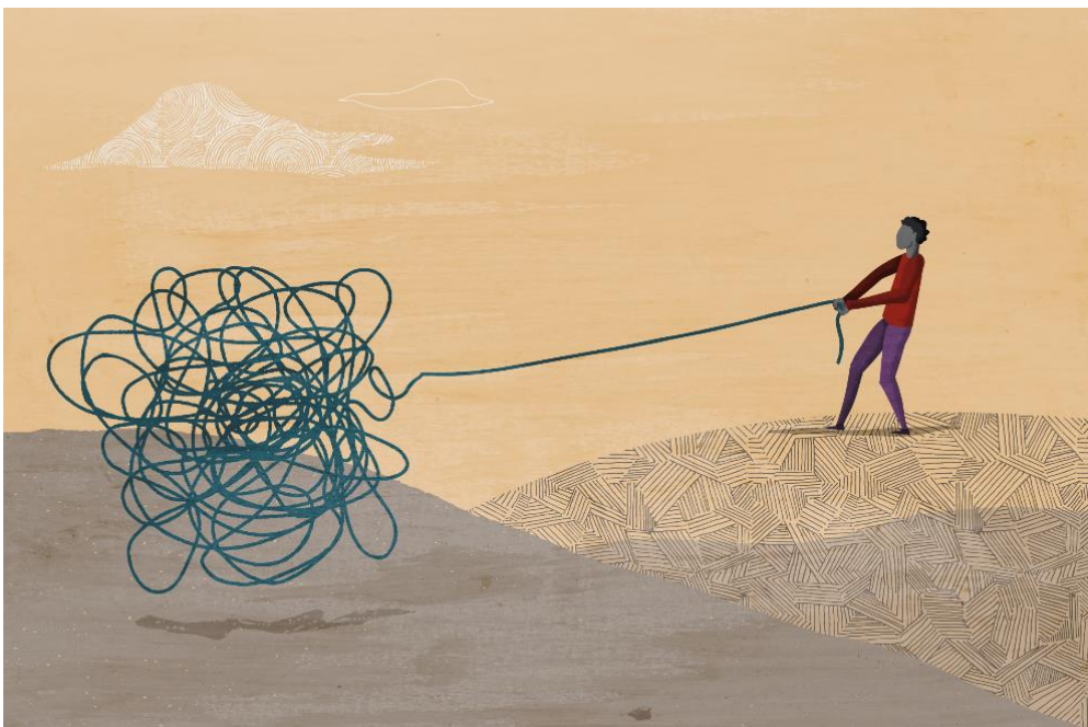
Figure 1. Customers want less complexity and more control across an increasingly complicated technology landscape

Organizations are seeking less complexity and more control across an increasingly complicated technology landscape. The dynamics and logistics are becoming more pronounced as companies shift their physical and virtual boundaries, expand their applications and user workloads across cloud and on-premises, and as compliance and regulatory requirements continue to evolve. Organizations are evolving their identity infrastructure as the new control plane to adopt and manage these security, identity, and compliance changes.